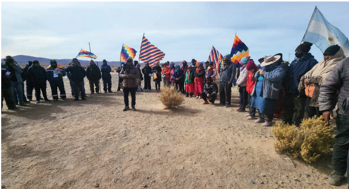
Demonstrators from the indigenous communities of the Salinas Grandes Basin and Laguna de Guayatayoc wave whipalas at the junction of Abrapampa and Moreno. August 23, 2023.