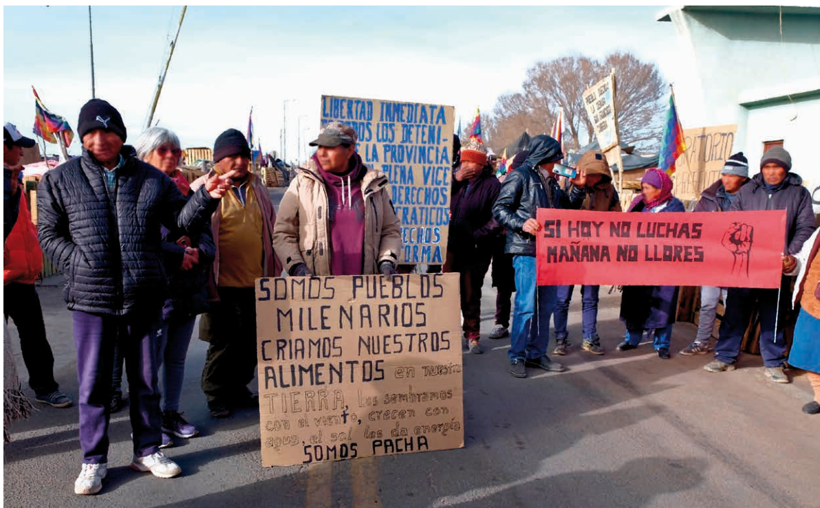
“We are millenary peoples. We raise our food on our land, we sow it with the wind, it grows with the water, the sun gives it energy. We are Pacha”. Demonstration of indigenous peoples of the Puna against the constitutional reform. August 2023

An indigenous leader from Abra Pampa underlined the lack of legitimacy of the new provincial Constitution, given the exclusion of indigenous communities from crucial decisions on the future of their ancestral territories: “They steal our wealth, they give us crumbs. They pollute our land. We have nothing, this constitutional reform is not for us; we have been excluded from the whole process at every step and we don’t have the capacity to change it or even get help from the courts because they will just do whatever the Governor wants to do.”