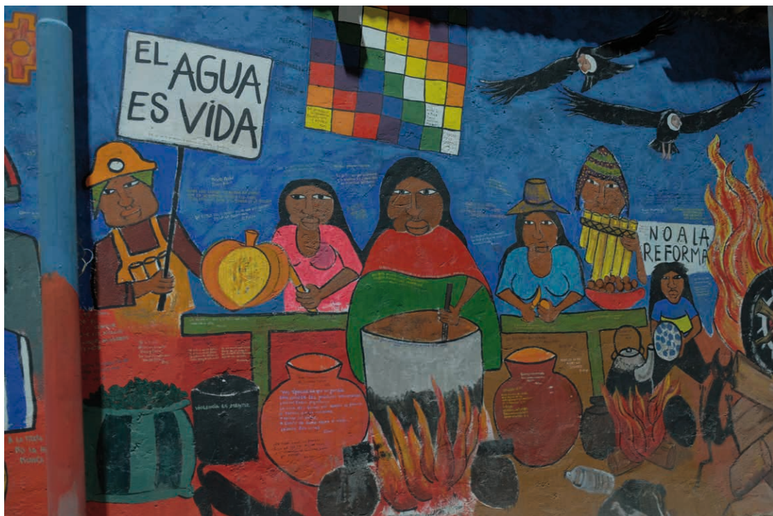
«Water is life. No to the reform». Mural alluding to the constitutional reform, with messages aimed at respecting the right to water. Purmamarca, August 2023

The new constitutional provision does not adequately address integrated management of basins, nor does it recognise the traditional uses of water by indigenous communities. On the contrary, it prioritises the large-scale exploitation of water sources, thus making it easier for water to be used in lithium extraction projects, which are also called “water mega-mining”. 94