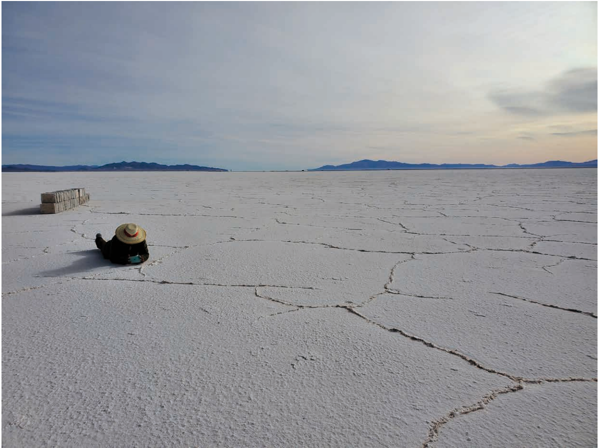
Salinas Grandes Andean Salt Flat. August 2023

The Andean salt flats of Argentina, Chile and Bolivia hold approximately 70% of world reserves of lithium in the form of brines. 44 These underground deposits of water and salts within the salt flats have high concentrations of lithium, and their exploitation is the easiest and most economically profitable of all methods for extracting the mineral. For this reason, the Puna region shared by the three countries is also known as the “Lithium Triangle”. 45